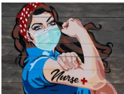
37 of 80 | A mural near a hospital pays tribute to nurses amid COVID-19 concerns in Dallas, Tuesday, April 7, 2020.

See more: https://www.usatoday.com/picture-gallery/news/world/2020/03/24/coronavirus-inspires-world-graffiti/2910639001/