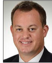
Ohio Valley District Chair