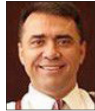
Twin Lakes District Chair