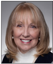
Blue Grass District Chair

Kentucky hospital CEOs are invited to the 2021 Fall KHA District Meeting - a statewide virtual meeting to update health care leadership on important state and federal advocacy goals, along with new key initiatives at the association and changes to the affinity partner program. Come network with your peers and discuss current issues across the Commonwealth.